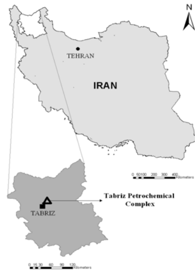
Fig. 1: Location map of Tabriz Petrochemical Complex in Iran (Abduli et al., 2007)

naphtha and liquid gas are mainly supplied via Tabriz oil refinery. Water supply is provided by east Azerbaijan local water organization, while electricity is produced in-site by means of domestic power plant. Location of TPC in Iran is shown in Fig. 1. The complex consists of different units. A general view of generation units with raw material and products is illustrated in Fig. 2. As it is seen in Fig. 2, existing sites may be classified in 5 distinct units; unit one deals with olefin and benzene, unit two 1-butene and polyethylene, unit three resistant, ordinary and expansive polystyrene, unit four ABS and 1-3 butadiene, and finally unit five which consists of services like steam, electricity, recovery and off-site (Abduli et al., 2007).